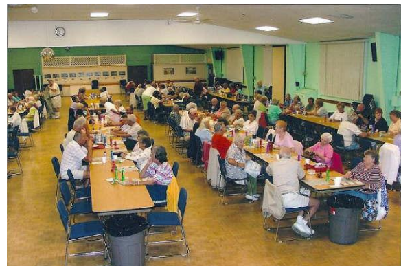
Trailer Estates Bingo